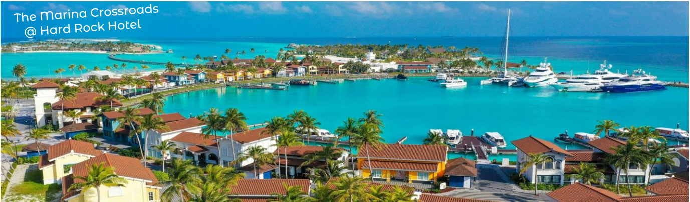
The Marina Crossroads @ Hard Rock Hotel