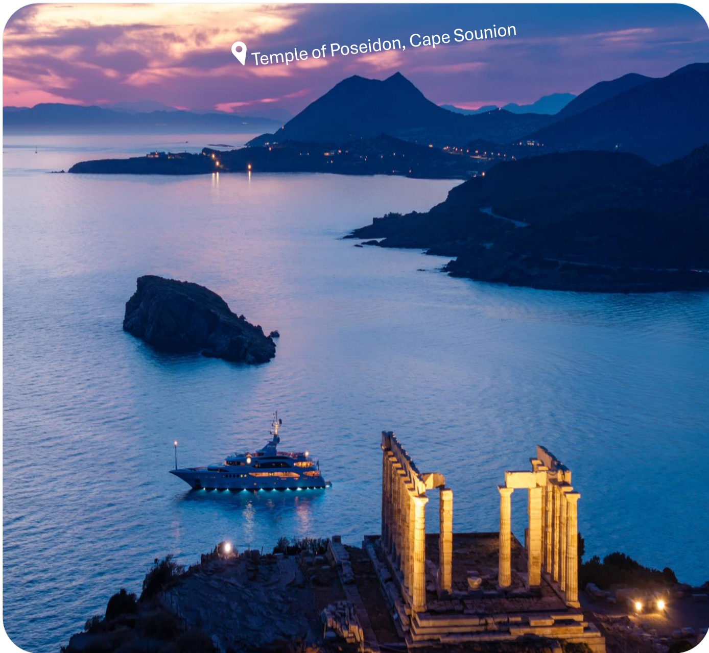
📍 Temple of Poseidon, Cape Sounion