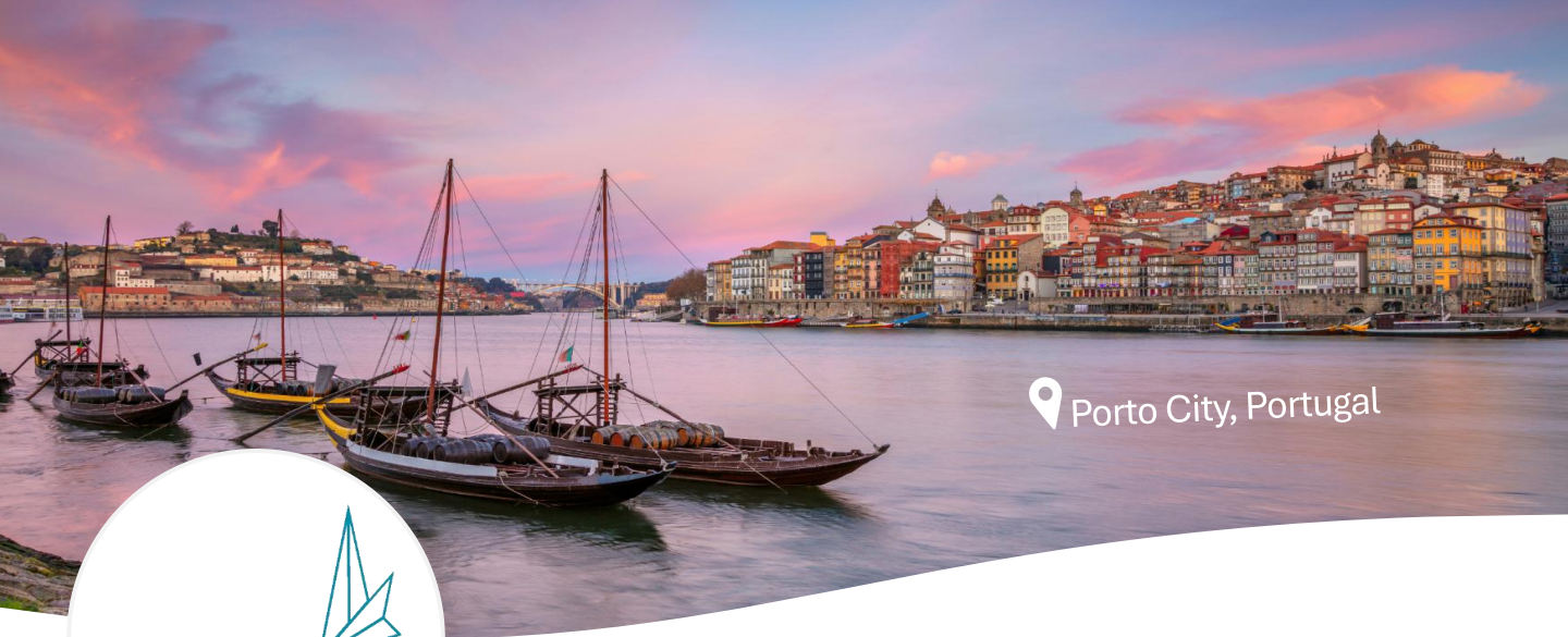
Porto City, Portugal